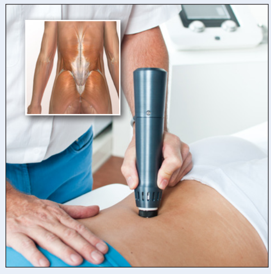
MYOFASCIAL TRIGGER POINT THERAPY E.G. BACK