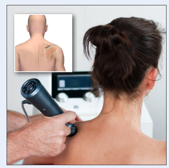
CALCIFIC TENDINITIS OF THE SHOULDER