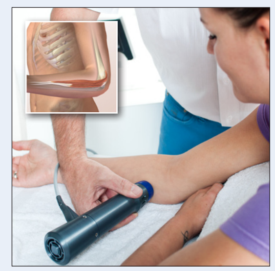
RADIAL AND ULNAIR EPICONDYLITIS

Endopuls 811: Radial shockwave therapy, mobile, long life, easy maintenance, clear touchscreen display