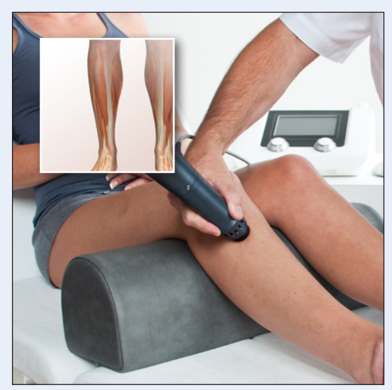
PERIOSTITIS / SHIN SPLINT (CONDITION AFTER OVERLOAD)