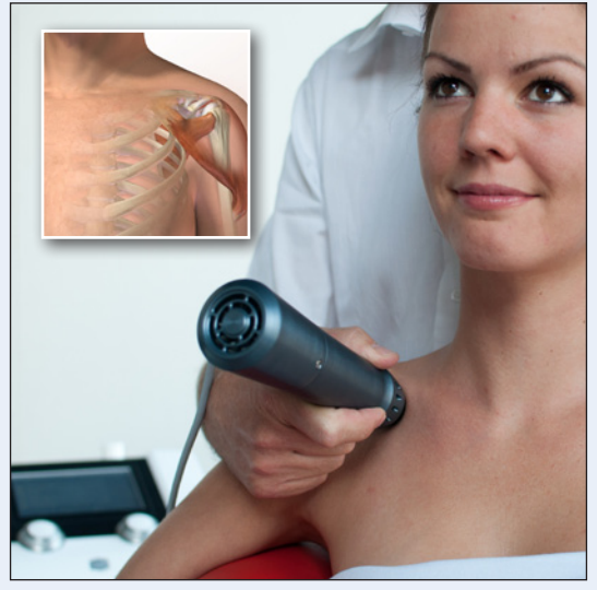
TENDINITIS OF THE SHOULDER / SHOULDER PROBLEMS