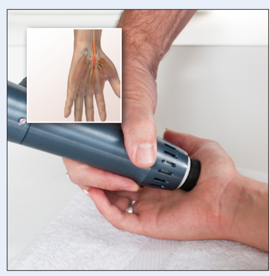
THUMB BASAL JOINT ARTHRITIS / RHIZARTHRITIS